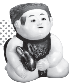
Goshoninyo (Court Dolls)

Dolls of dogs, rabbits, monkeys or other creatures, made of silk.