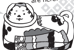
Inu-hariko ( Inu-bako )